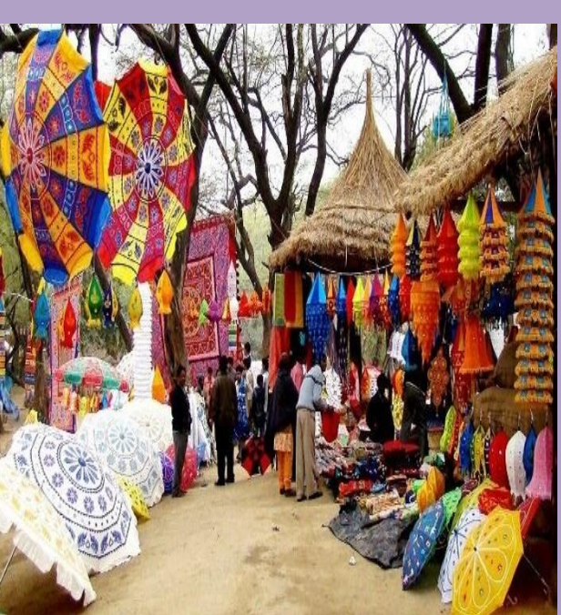
Students at Haryana Mela